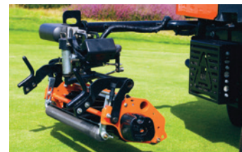
Easy access swing-out centre cutting unit

New linear actuators with exceptionally long life