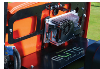
ELITE™ lithium battery & on-board high frequency 18 amp, 48V DC output, 85 - 265V AC 45 - 65 Hz input