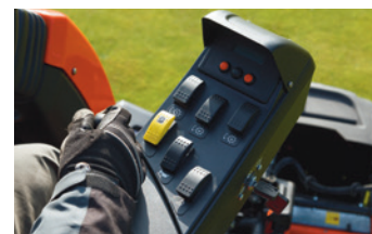
Programmable frequency of clip